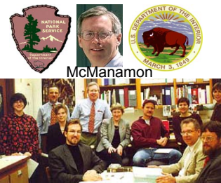
Scientific Examination Team

"For an inadvertent discovery on federal lands the law reads that it should go to...the tribe aboriginally occupying the area or the tribe with the closest cultural affiliation. This is why there has been so much effort to try and prove or disprove whether the remains are culturally unidentifiable."